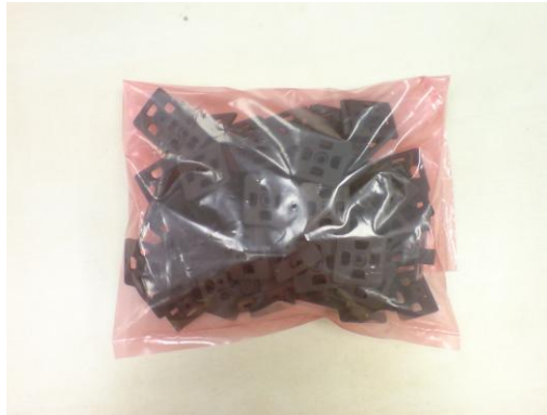
Fig 2. Examples of packaged gaskets in a bag.

Quantities of gaskets and grommets as per description are placed in a bag 1211160581. A quantity of bags is placed in a carton for shipping (see table 2 for bag quantities and carton numbers). Use blank cartons and customer tape where applicable.