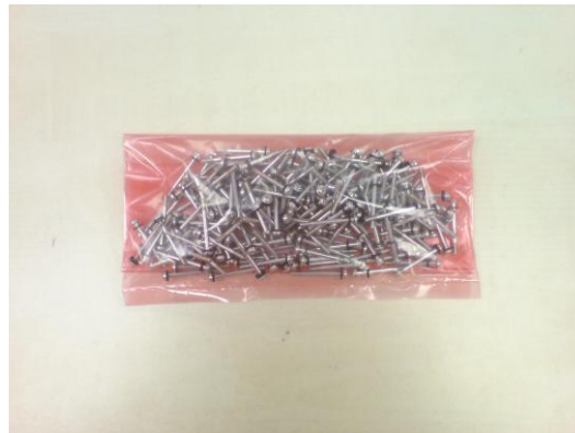
Fig 1. Examples of packaged screws in a bag.

Screw quantities as per description are placed in a bag 1211160580. A quantity of bags (see table 1) is placed in a carton 967070005 for shipping. Use blank cartons and customer tape where applicable.