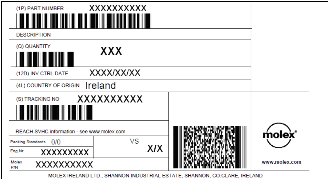
Figure 4 – Molex Label Example